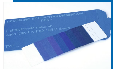
Blue Wool numerical scale 1-8 – stripes fixed on card ready for use