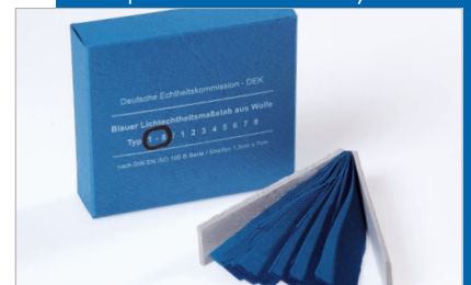
Blue Wool stripes 1-8 for mounting