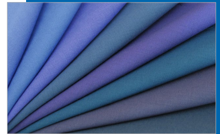
Blue Wool Reference 1-8