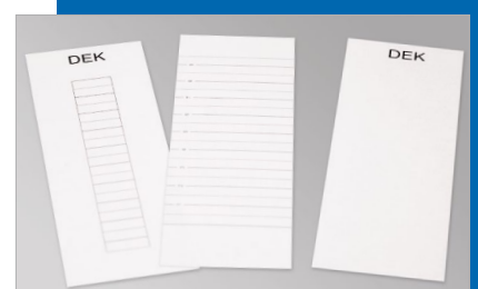
Mounting Card (OBA-free)